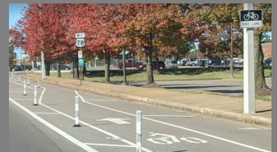
DELINEATOR POSTS ON MLK AVE.

FLEXIBLE DELINEATOR POSTS ARE ONLY A VISUAL CUE AND EASILY RUN OVER