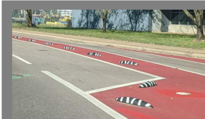
ARMADILLO BUMPS ON MLK AVE.

EXISTING RUBBER BUFFERS ARE EXPENSIVE AND MANUFACTURED OVERSEAS